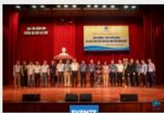
2022, June 02, Participation at "University – Employer Forum and Students Career Day 2022" at Halong University, Province of Quang Ninh