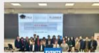
Capacity building on Survey reporting event, FH Joanneum – University of Applied Sciences, Graz, Austria, 28-30 March 2023