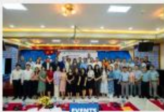
Dissemination events and workshops in Ho Chi Minh City at PTIT Branch, 21-22 September 2023