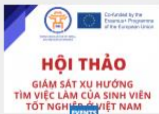
Local dissemination event at HanoiSME, August 24, 2023