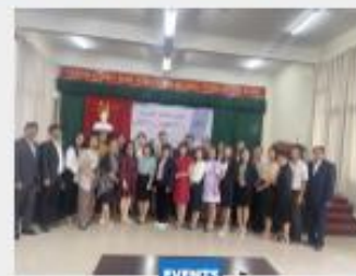
MOTIVE Project local dissemination event and workshops, Da Lat Center, Da Lat City, Vietnam 19-21 September 2022